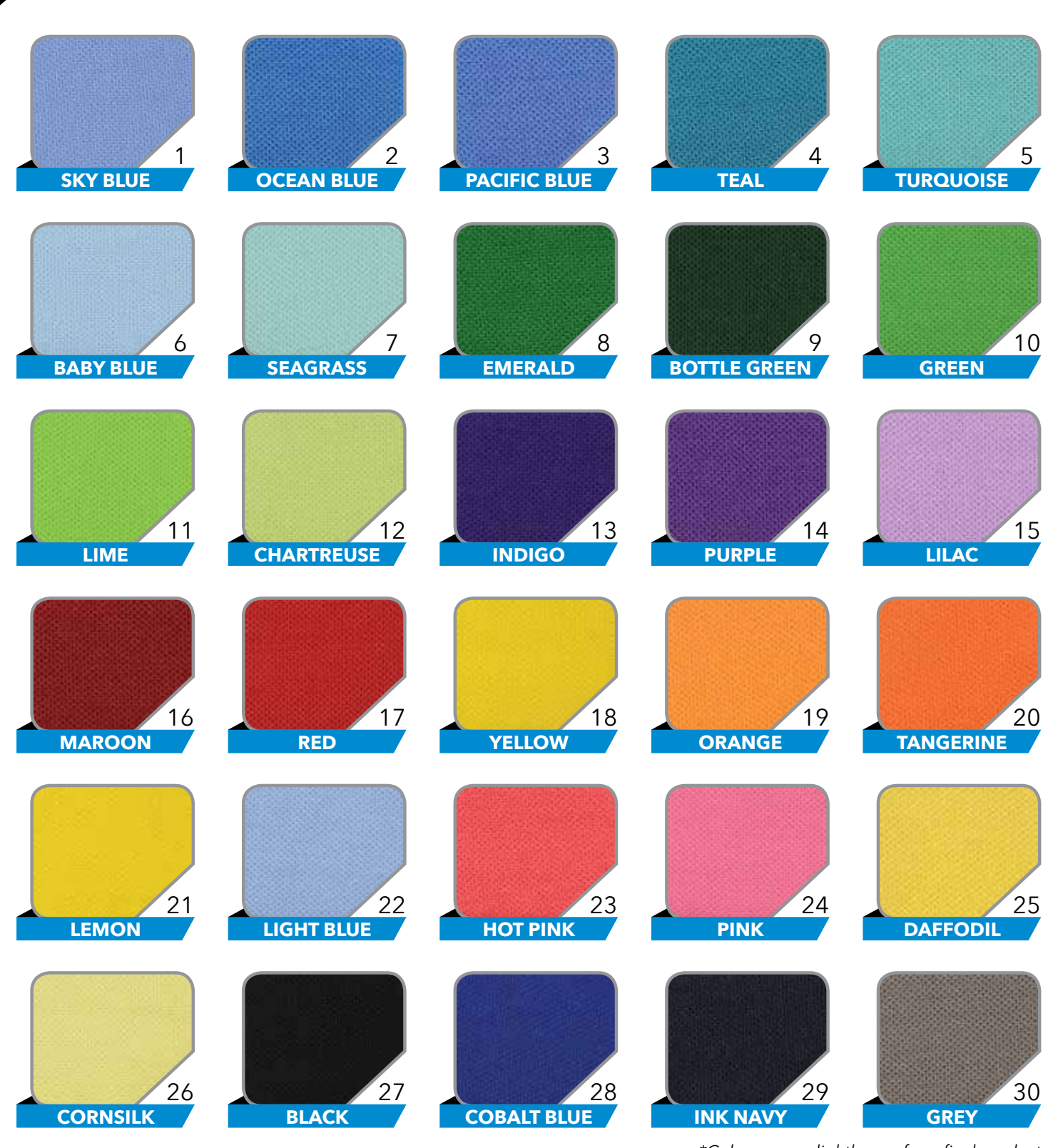
*Colours may slightly vary from final product