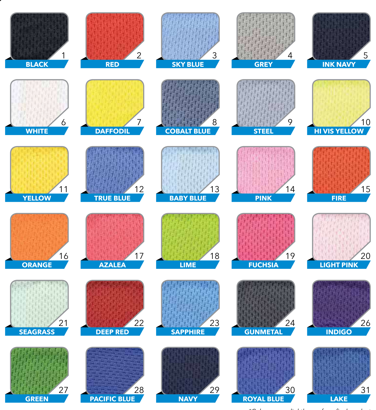
*Colours may slightly vary from final product