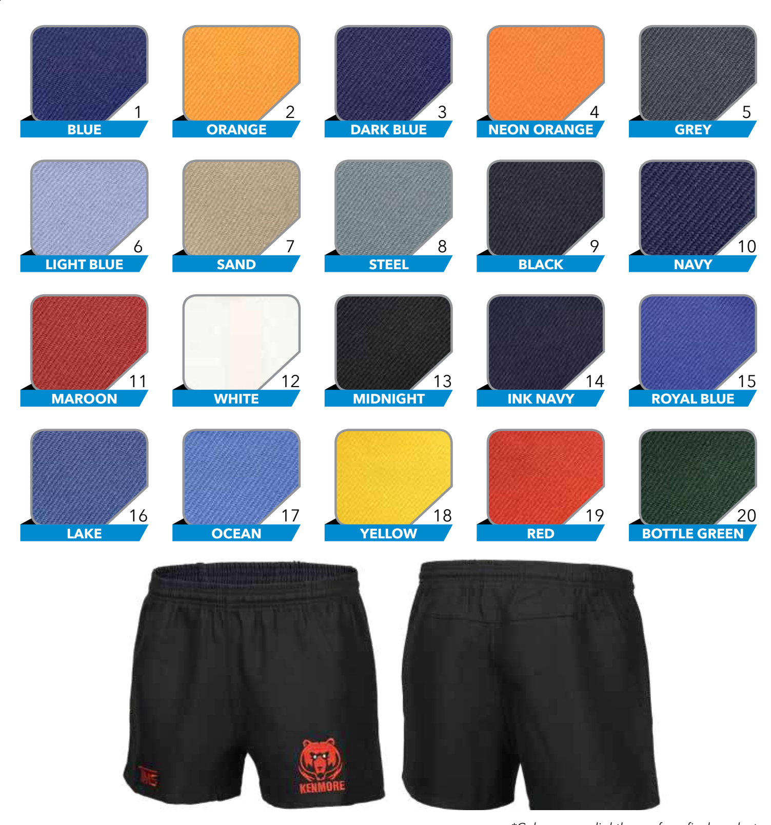
*Colours may slightly vary from final product